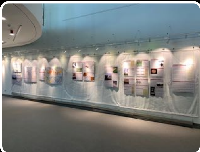
A temporary exhibition area