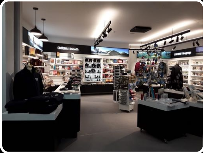
A Gift Shop